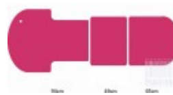
15cm 15cm 15cm