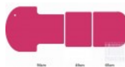
50cm 50cm 50cm