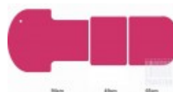
50cm 45cm 45cm