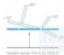
Height range 50cm to 103cm