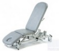
TAPICERKI STANDARD [W CENIE ]